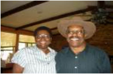
Lions in Service,

Hello fellow Lions, We have completed our Thanksgiving Holiday festivities and we're headed into the Christmas/New Year Season. We have much to be thankful for and this is the time of the year that Lions can make a big impression on their local communities by helping those in need in your community. So let's